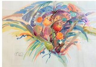
Passion Fruit, WTRCL

Keep an eye for the March Award Winners & Upcoming News