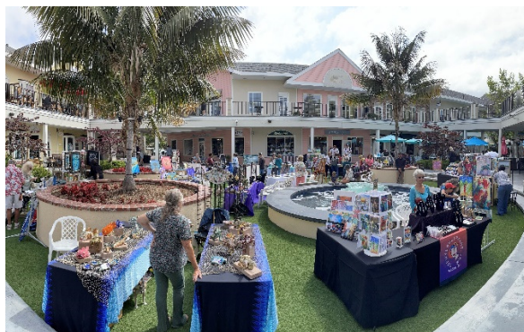
SAMPLE photo/may of 2023 show setup.